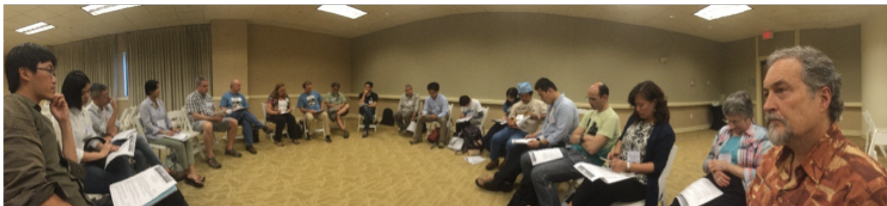
The Northeast Asia Seabird Conservation Committee.