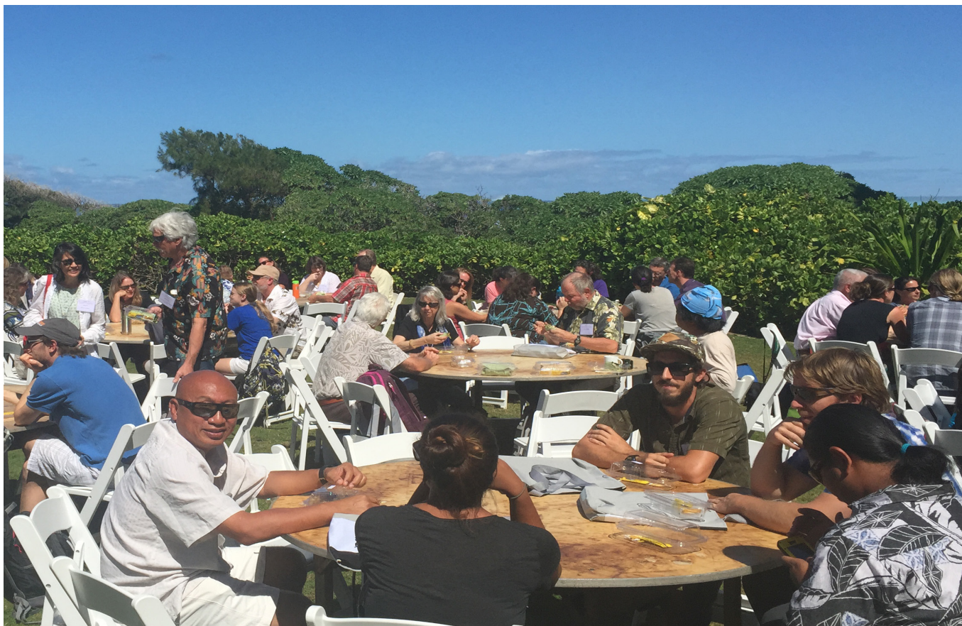
Enjoying lunch in the Hawaiian sun