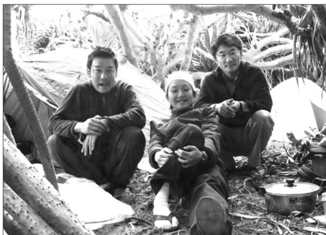
With students at research camp on Ogasawara . . .