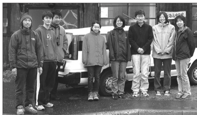
. . . and in the rain