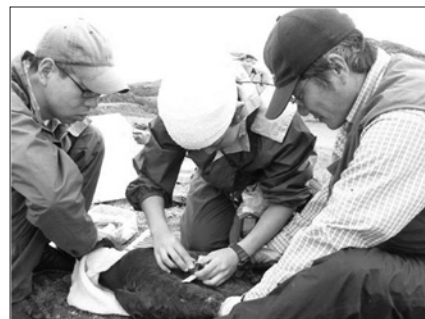
. . . and instructing students