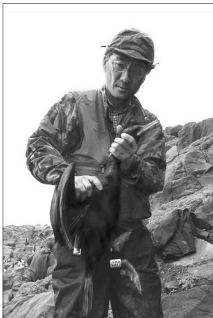
Watanuki persuading cormorant . . .

while mean swim speeds stay between 1 and 2 m per second no matter how large the animal.