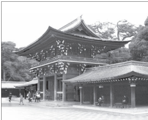
Shinto shrine, Meiji Park, Tokyo