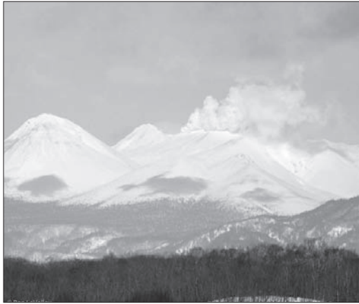
Meakan Volcano, Hokkaido.

Ocean Policy Program provided major support for travel by scientists.