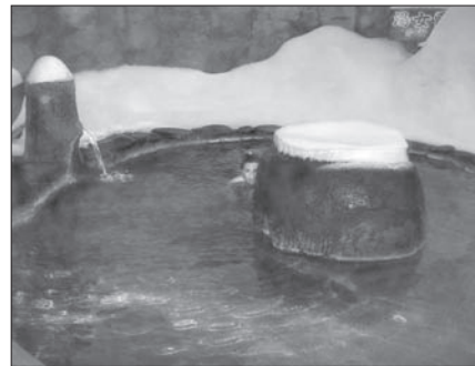
Outdoor onsen (hot spring) at Meto, central Hokkaido. The shy person is bathing au naturel .