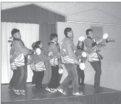
The Squid Dance: local experts performed; then PSG joined in . . .

Major sponsors of PSG'S meeting in Hakodate included the City of Hakodate; the Graduate School of Fisheries Science, Hokkaido University; the Japan