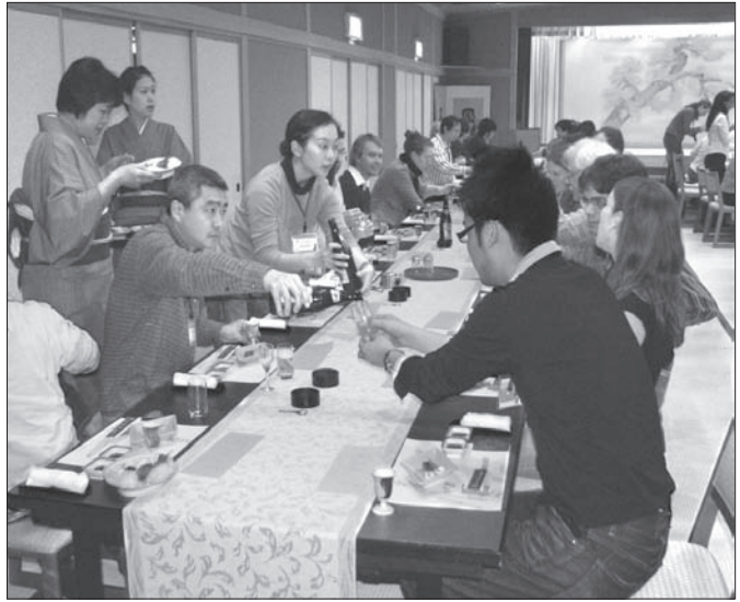
PSG Dinner at Chikuba Shinyotei Restaurant, Hokkaido.

A post-conference field trip took us to the Shimokita Peninsula on Honshu,