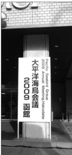
Meeting poster at hotel entrance.