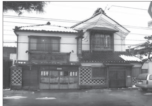
Traditional house, Hakodate