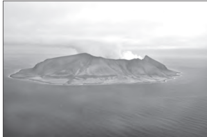
The new Kasatochi Island, Sep 2009.

Field crews from Alaska Maritime National Wildlife Refuge (AMNWR) have spent the last 13 summers on Kasatochi, a major seabird monitoring site in the central Aleutian chain. The island was a volcanic cone 314 m high and 260 ha in extent, with lush vegetation and a deep-blue lake in its crater. Slopes of grass and forbs, talus, and rock provided habitat for more than 200,000 auklets, murres, puffins, storm-petrels, cormorants, gulls, and guillemots. Biologists stayed in a renovated 1920s-era cabin that was originally built by a fox trapper. They compiled data on population trends, survival, productivity, chick growth, and diets. They also monitored songbirds, avian predators (including diets), and