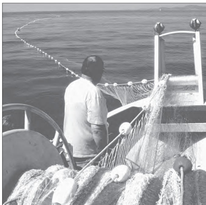
Setting gillnet in Puget Sound, with white "bird panels" in upper portion. Normal monofilament net appears darker on drum in foreground, and it hangs in water below the "bird panel."

Ed's newest work focuses on the Southern Hemisphere. Many albatross populations have been declining sharply in the southern oceans since bycatch in longline vessels began. The Commission on the Conservation of Antarctic Marine