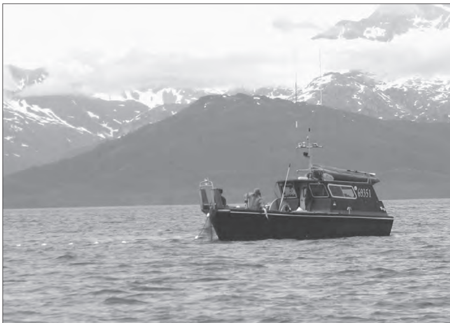
Gillnetter in Prince William Sound. Net is suspended in water below the white floats. Net is being retrieved over roller on the bow, as fisherman removes the catch.

in the top portion of gillnets for non-treaty fishers. (Regrettably, the Treaty Tribes and Canada, which participate in the same fishery, have no requirements for reducing seabird bycatch.)