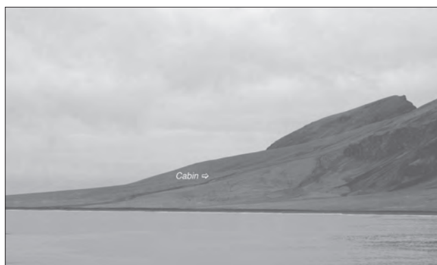
Kasatochi Island after eruption, from same viewpoint as photo at left. Site of cabin is indicated. Note how shoreline now extends farther to left and towards viewer.