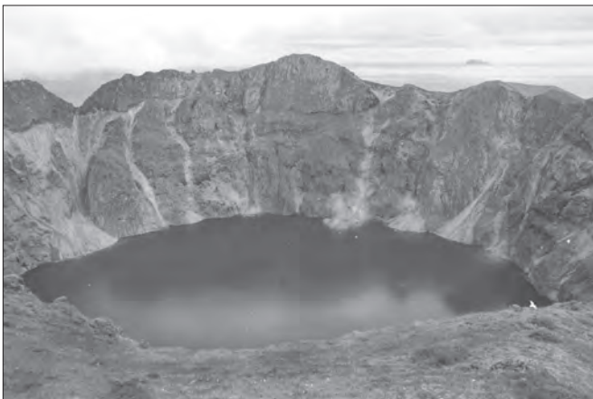
Kasatochi crater on 6 Aug 2008, the afternoon before the eruption. Tremors are causing rockfalls from cliff into lake (opposite side, just right of center).