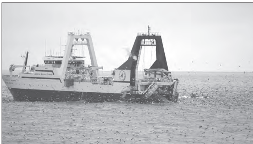
Trawler in Alaskan fishery. Net is being retrieved; "cod-end" full of fish is lying on water and moving up ramp at stern of vessel, and is surrounded by seabirds.

Living Resources (CCAMLR) started requiring vessels to use deterrents as early as 1992; Ed's group recently joined them to review the effectiveness of current methods. In 2008 Ed began research to improve deterrents on pelagic longliners in the mid-southern latitudes. Hooks that target tuna ( Thunnus spp.) and other fish are suspended in mid-water and sink slowly, and thus require different deterrents than in high-latitude demersal longlining. During a pilot project off South Africa, Ed modified the tori lines that the vessel was already using. His new version made a good impression: "the difference . . . was dramatic (a collective gasp from the crew)" (Melvin et al. 2009:6).