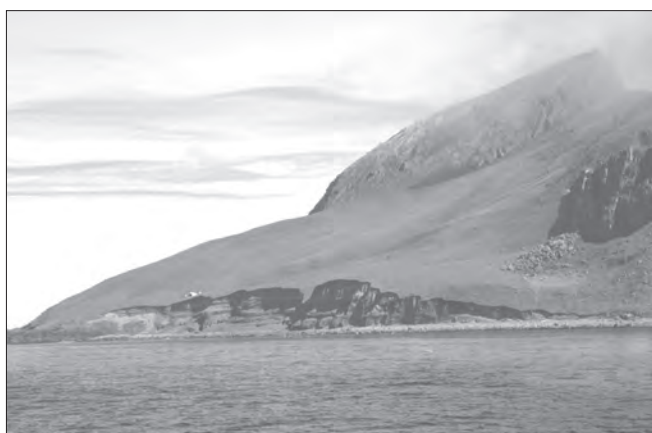
Kasatochi Island, 2006. Refuge cabin (former fox trapper's cabin) is small white object at top of low cliff, near left side of photo.