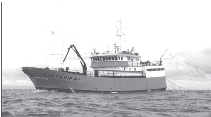
(Above) Longliner with two streamer (tori) lines rigged astern. (Below) A pair of tori lines as viewed from stern of vessel. Seabirds avoid the tori lines and only gather behind the deterrents, but at that point the longline fishing gear is too deep for surface-feeding birds to reach the hooks.