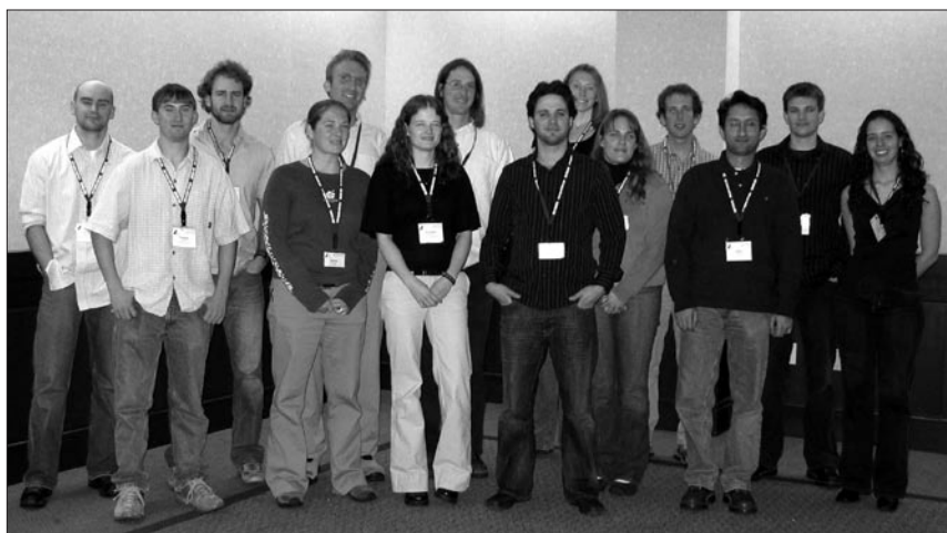
TRAVEL AWARD RECIPIENTS AT THE PSG 2006 ANNUAL MEETING. Above, student awardees; below, non-U.S./non-Canada award recipients.