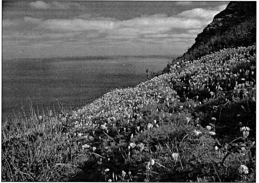
Figure 2. California poppies on the Coronado Islands. By Bradford Keitt.

The Coronado Islands also support globally significant populations of nocturnal seabirds, including auks and storm-petrels. Such birds are active on their breeding colonies only at night, mainly as an adaptation to avoid diurnal predators such as gulls and falcons ( Falco spp). Nocturnal seabirds are extremely sensitive to light pollution. Lights affect them in two main ways: (1) seabirds are attracted to the lights, thereby disrupting their normal activities and causing mortality as birds fly into lights or structures around them, and (2) light can increase susceptibility to predation by illuminating areas at sea and on the colony. Populations of the Xantus's Murrelet ( Synthliboramphus hypoleucus ), which was just listed as threatened by the state of California, are at the greatest risk from the lights associated with the proposed LNG terminal. This species is especially susceptible even to low levels of light pollution because the birds socialize in nearshore waters while attending colonies from January to July. The world's largest colony of the northern subspecies of Xantus's Murrelets ( S. h. scrippsi ) nests on the Coronado Islands (Whitworth et al. 2003). These islands also host the southernmost colony of the rare Ashy Storm-Petrel ( Oceanodroma homochroa ) and a significant colony of Black Storm-Petrels ( Oceanodroma melania ) (Carter et al. 1996, Everett 1991).